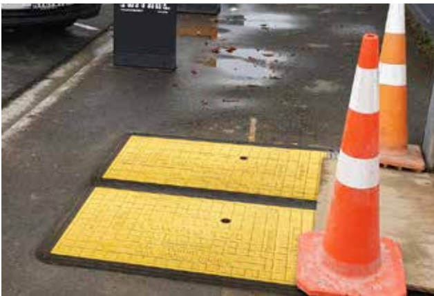
LowPro rubber edging prevents moving/creeping covers.