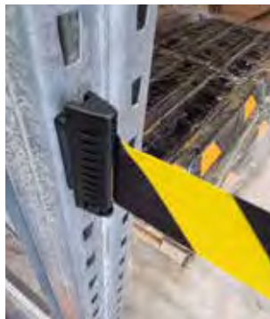
The base unit and belt ends magnetise to steel surfaces.