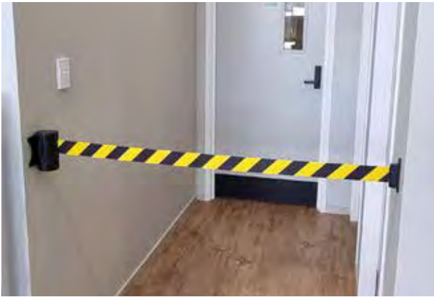
Easily cordon off doorways for restricted access.