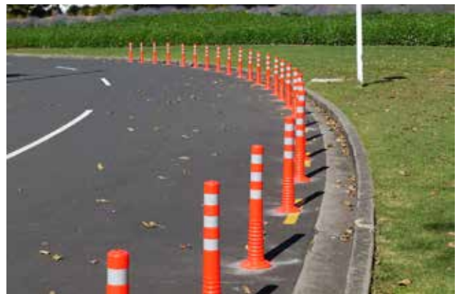
The hi-vis orange Flexible Bollard is great for directing vehicles away from pedestrian zones.