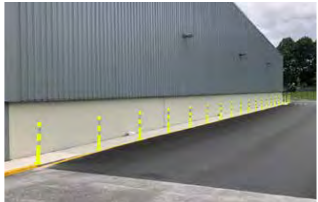
Ultraflex Delineators are ideal for busy areas as they can take multiple hits and return to their original shape.