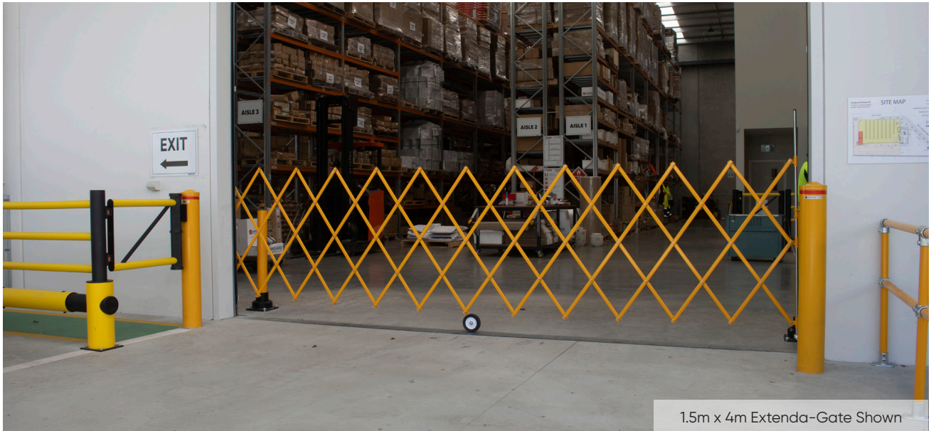
1.5m x 4m Extenda-Gate Shown