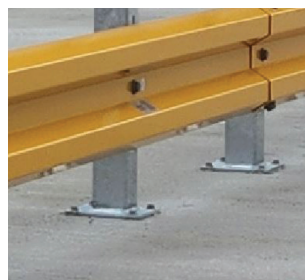
⑥ Narrow Spacing Posts mounted 1.1m apart to prevent pallets from penetrating into the protected zones.