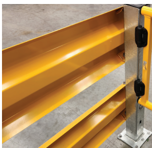
⑤ Cavity Free Edges Tru-Gard™ Barrier has no cavities to hold moisture, germs or pathogens that could compromise the structure and hygiene.