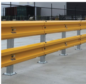
③ Front-mounted Rails Tru-Gard™ Barrier is fastened to the front face of the posts as opposed to between the posts, which creates a stronger structure.