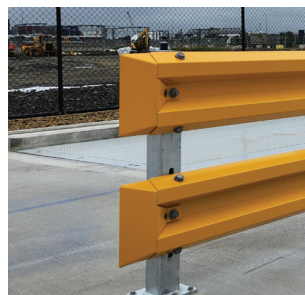
④ Coated Edges Tru-Gard™ is made from uncoated steel, then fully coated to ensure no edges will potentially rust.