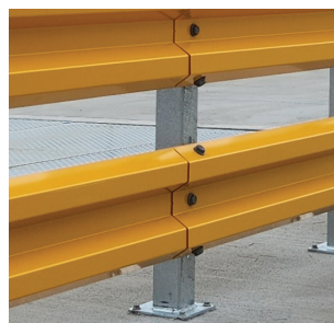
② Overlapped Rails Tru-Gard™ Barrier overlaps by 200mm and is joined with three bolts to provide maximum strength. Under impact the load is instantly spread.