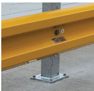
① Small Footprint Tru-Gard™ 200mm footprint saves you space.